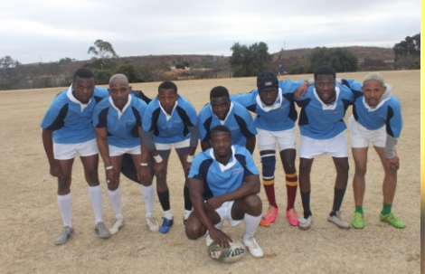
College Open Days